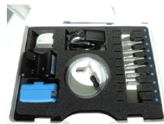
Fig 3 : MPS suitcase