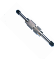
Fig 2 : MPS